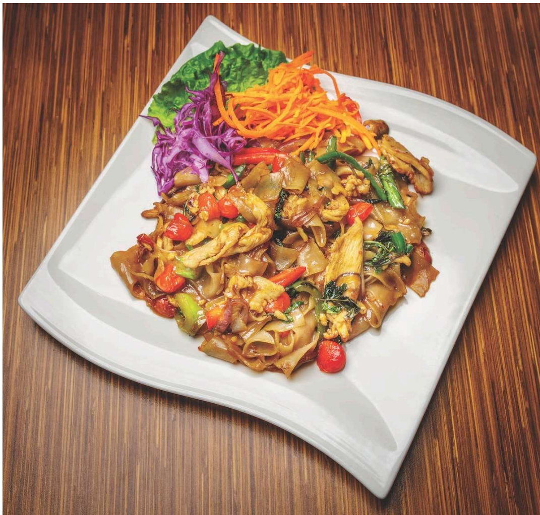
The Drunken Noodles at Blai.

your geographic We currently hav as well. The oper. manufactures kind of dishes as to be healthy and continue getting, what under these circumstances was difficult.